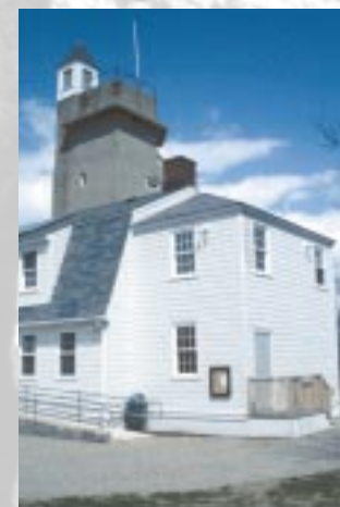
A restored World War II fire-control tower houses the park's Visitors Center and Headquarters.

Take Rt.95/128 north to Rt.128 north toward Gloucester and Rockport. After crossing the Annisquam River bridge, go three-quarters around the first rotary, following signs for Rt.127 north (Annisquam and Pigeon Cove). After approximately 6 miles, turn left at the park sign and the Old Farm Inn onto Gott Ave. From downtown Rockport, drive north on Rt. 127 approximately 3 miles, turning right onto Gott Ave.