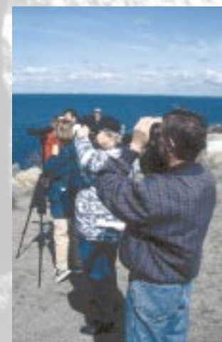
The park's large grout pile (a granite waste heap) is a popular scenic overlook and winter birding site.