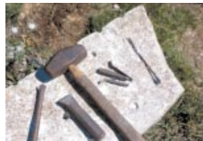
A quarryman's basic tool kit: plug drill, tracer, hammer, wedge with half-rounds and spoon

The orange-brown granite across the quarry to your left is called seam-faced granite. It was colored over many thousands of years as water seeped through the naturally-occurring cracks in the granite, causing the iron-containing minerals in the granite to oxidize or 'rust'. During the 19th century, this sapstone was considered undesirable because of its color, but after 1900 it came into fashion as veneer for the surfaces of buildings. After being removed from the quarry, it was taken to a cutting shed, cut into pieces several inches thick, and polished to a high gloss.